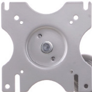
Single monitor arm